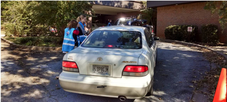
Habersham County residents take advantage of the convenience of the drive through flu clinic held on October 19. This was the third year that the drive through option was offered.