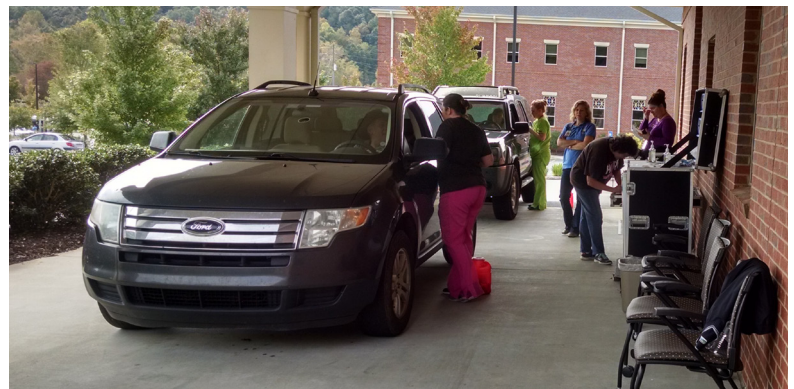
Lumpkin County Health Department held two drive through flu shot clinics this year. The first was held on September 25 during a rainy day. They did catch a break on October 9 and had better weather.