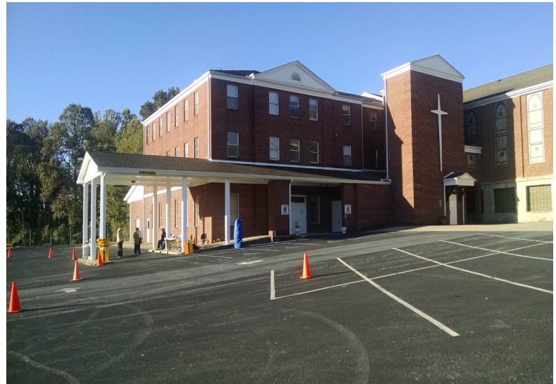
Rabun County held their first drive through clinic at Clayton Baptist Church which is adjacent to the health department. This location worked well with the portico and established traffic pattern. The health department remained open during the drive through.