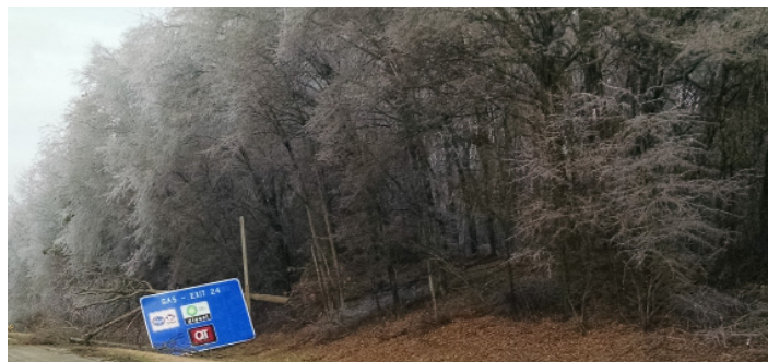
Falling trees take down a road sign on Hwy 365 in Hall County during the February 16-17, 2015 ice storm.

Preparing and making sure that we have a plan to survive on our own for at least 72 hours (three days) is the first step to preparedness. It is also important to ready our property, homes, and families for any type of emergency that might occur. Assess your property for trees that could potentially fall across power lines or your home. Consider