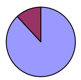
Pop. Served in 1 Year

Percent of Population 12% (1 Year) 36% (5 Years)